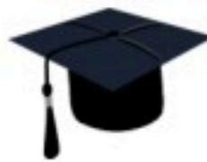
Gradu a tion