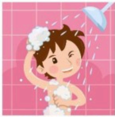
take a shower

karate – wake up – take a shower – work out – brush your teeth