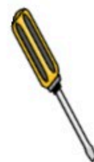
Screw d river