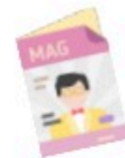
Mag a zine