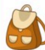
Back p ack