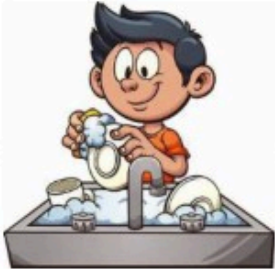
wash the dishes

do the laundry – iron the clothes – go bowling – hang out – wash the dishes