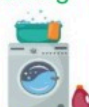
Do the laundry