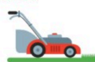
Mow the lawn