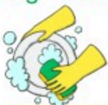
Wash the dishes

go bowling - mow the lawn - do the laundry - go skiing - wash the dishes