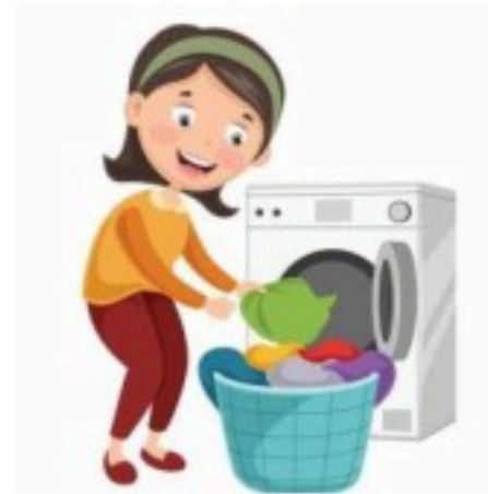
do the laundry